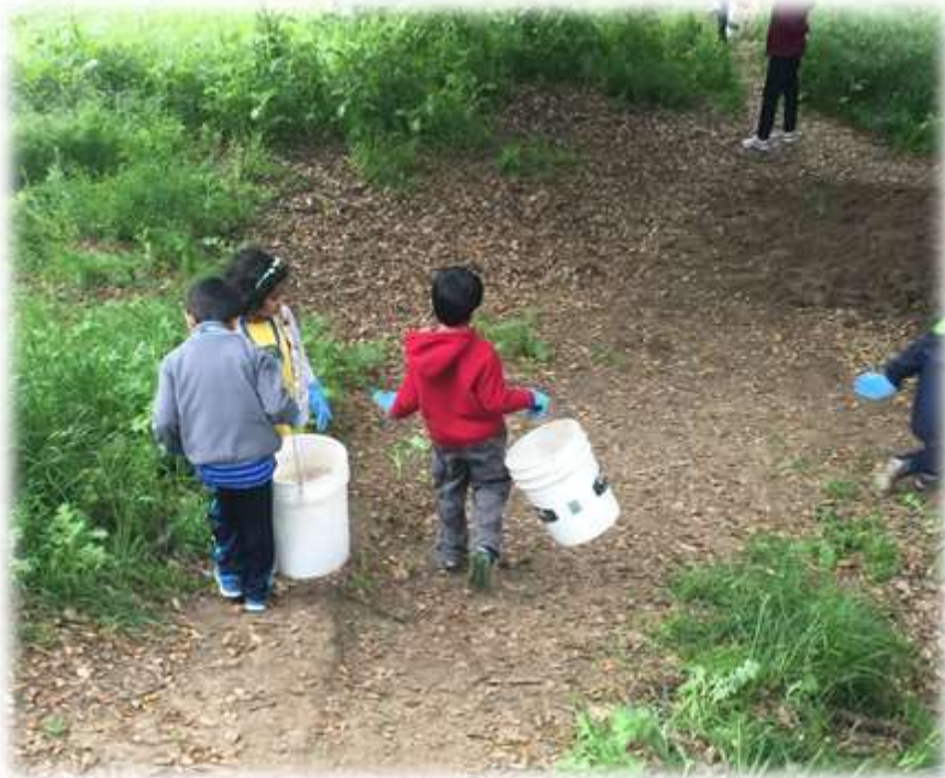
GeniusKids group of San Ramon Market Place removing trash from the Marilyn Murphy Kane Trail.