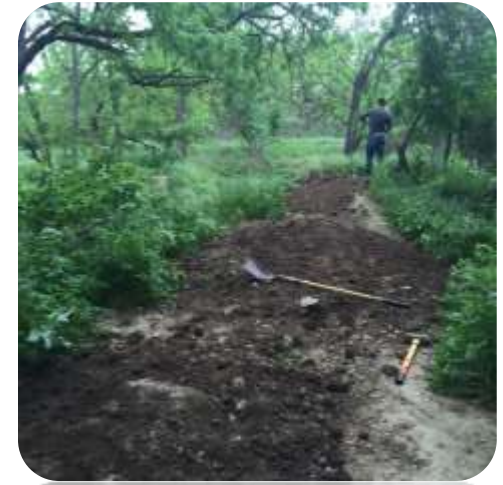
Before and after photos of Living Arroyos staff breaking down 7 BMX dirt mounds at BMX Track.